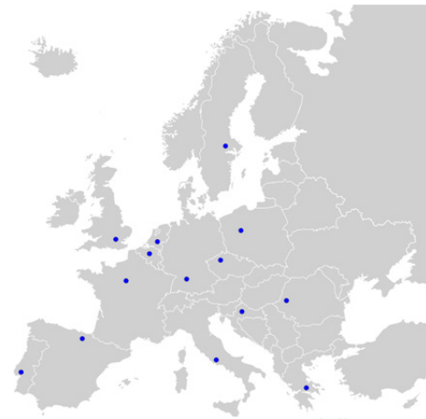
The location of the seminars around Europe

The seminars around Europe will offer the opportunity to present not only the results of the SBRIplus project, but also the advanced application to innovative solutions in addition to national regulations and practice.